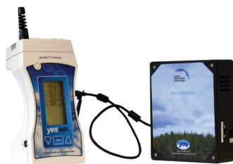
YES AIR attached to a remote particulate sensor, YES DUST.